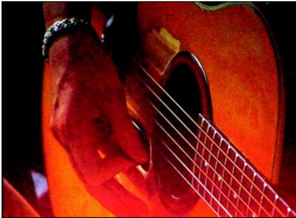
On the Titanic size screen at the Coleman Theatre, beautiful scenes of the band and places they visited on one of their annual tours of Ireland were shown during the show. The beauty of the Emerald Isle was truly welcoming.