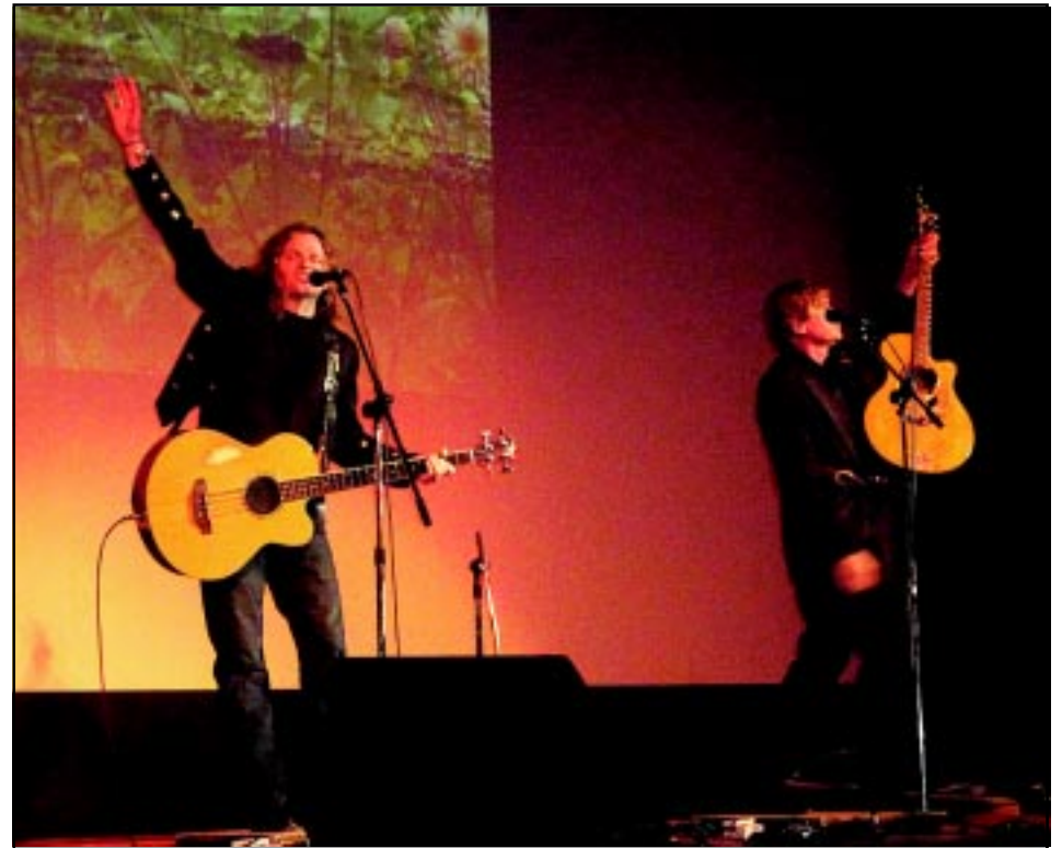
Traditional Irish humor and comedy was part of the story told by the American born Irish rooted sensation... Switchback.